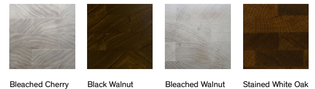
Bleached Cherry Black Walnut Bleached Walnut Stained White Oak

The N3-Au Chandelier is available in bleached cherry (shown above), black walnut and bleached walnut in a clear lacquer finish; the stained white oak features a hand-rubbed oil & wax finish