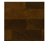
Stained White Oak